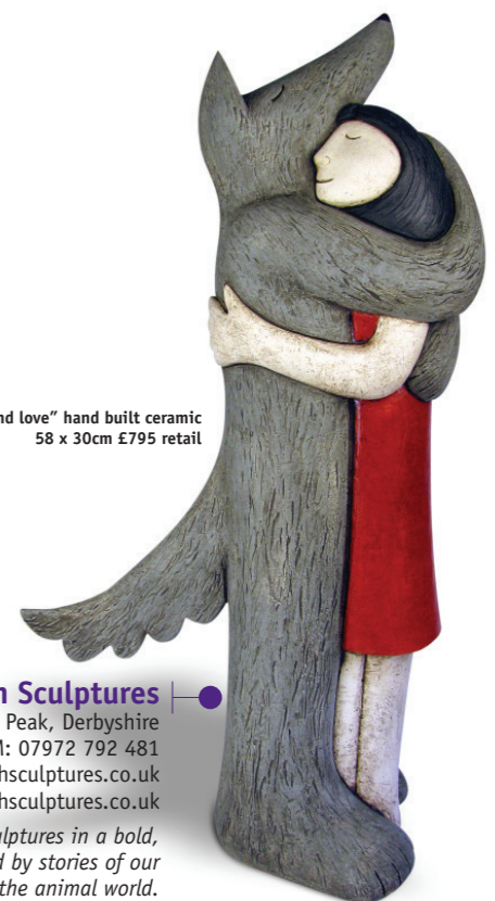
"Blind love" hand built ceramic 58 x 30cm £795 retail